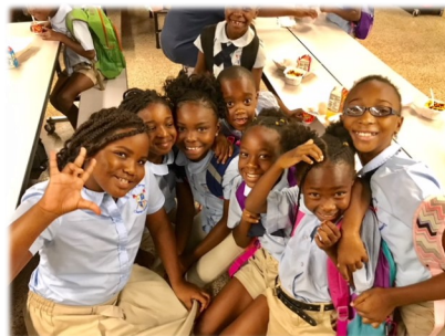
The Breakfast Crew!